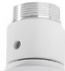
GBR-AM02 Adapter Ring for Pelco Pendant Mount with 1,5" NPT thread